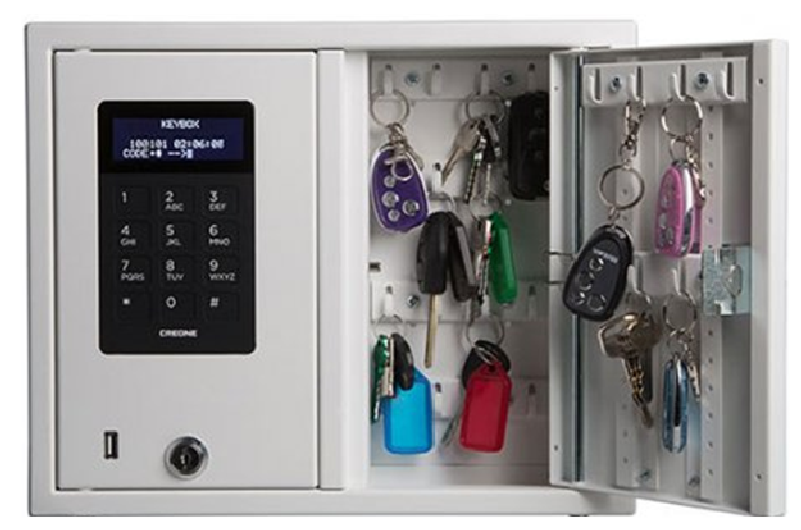
Secure Key Storage Solutions

Our Key-Box Computerized Key & Asset Management Systems Save Time and Money for Businesses and Organizations by Providing Secure Management of Facilities Keys