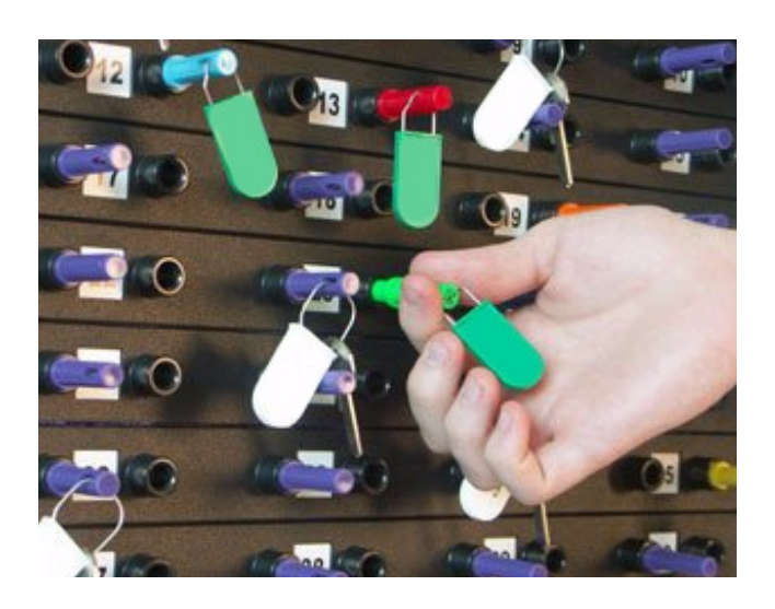
9500 S Secure-Lock

The Key-Box KeyWin Light software provides a full audit trail and activity reporting, detailing who has accessed the cabinet and when. As a result, staff become more accountable and our customers have found that keys are returned at the end of shifts. This leads to reduce security requirements, with less loss, damage and liability