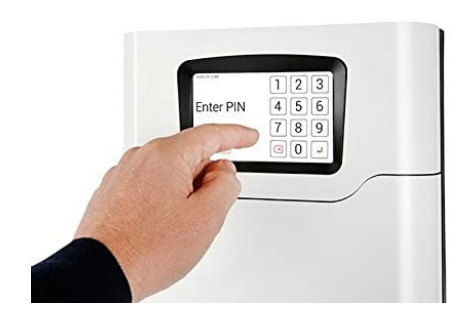
User is required to enter their unique access PIN code to gain access to the key cabinet