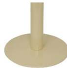
Non rusting Aluminum base